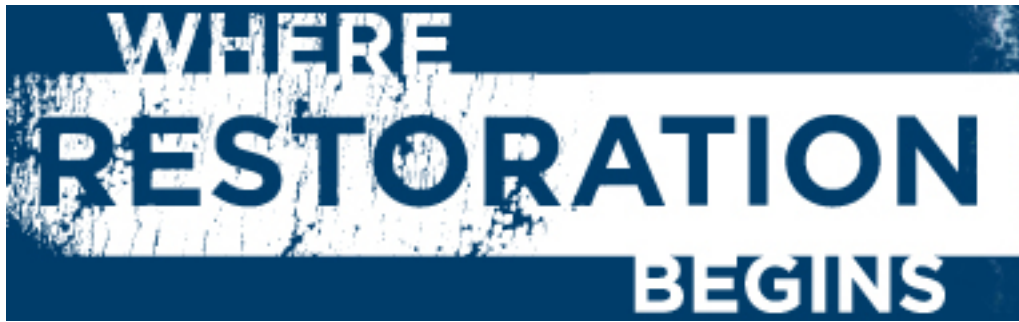
Table Captain Job Description